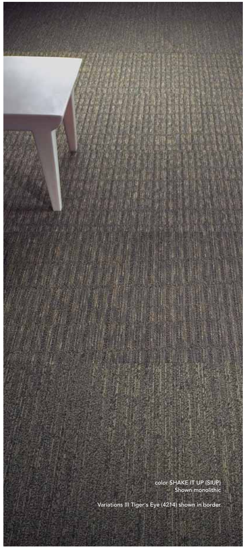
color SHAKE IT UP (SIUP) Shown monolithic