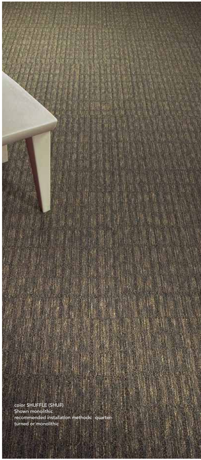
color SHUFFLE (SHUF) Shown monolithic recommended installation methods: quarter- turned or monolithic