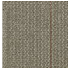
tapioca pudding (42102)