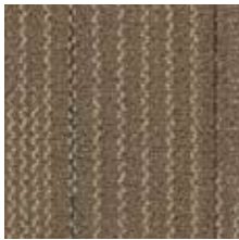
graham cracker (82099)