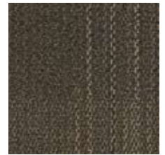
chai latte (83098)