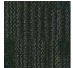
watermelon rind (45104)