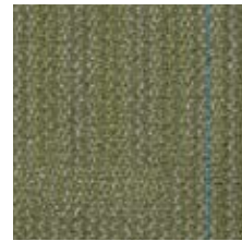
green apple (43093)