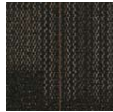
fudge brownie (85103)