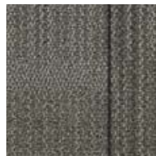
cookies n cream (14107)