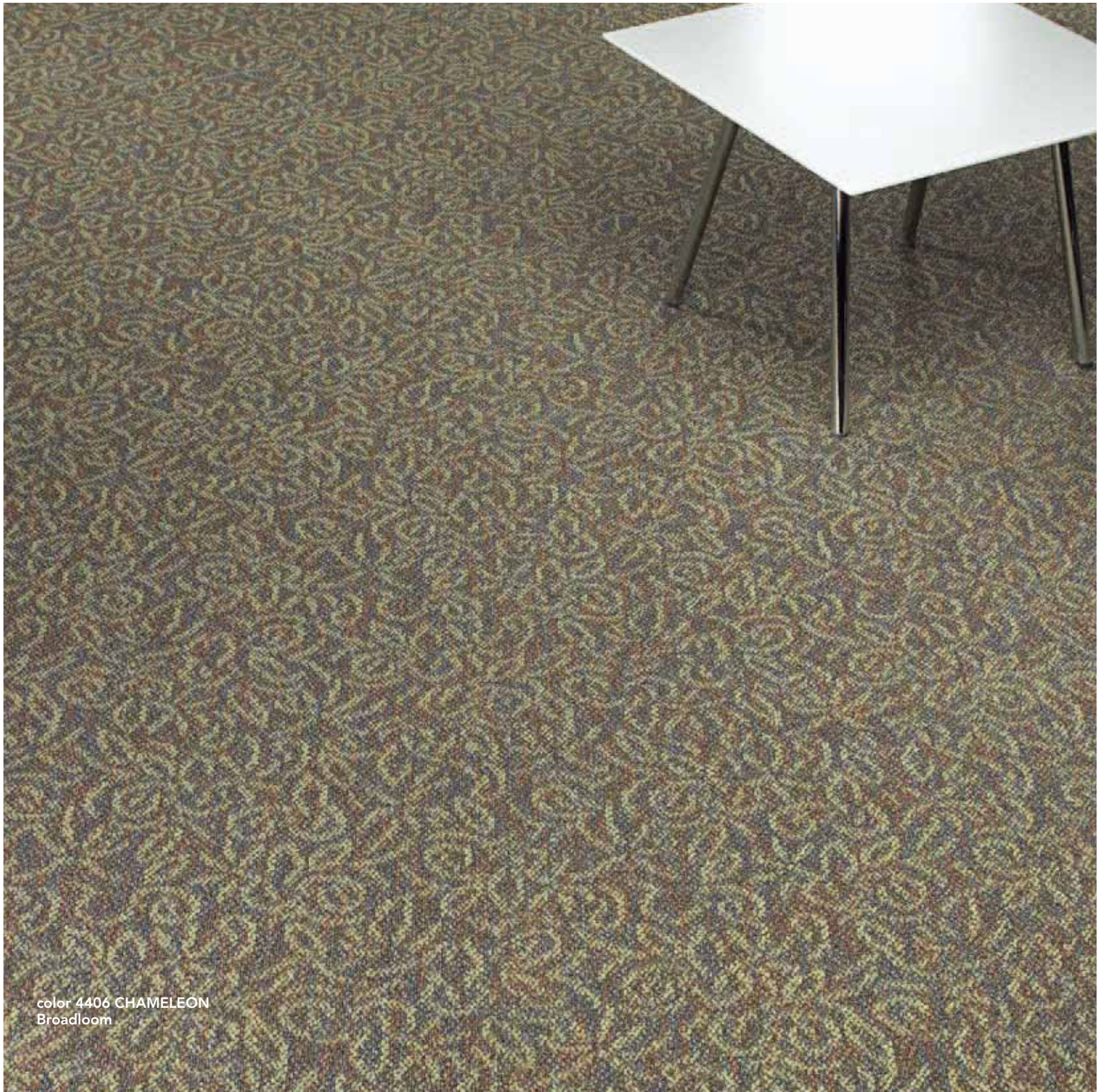
color 4406 CHAMELEON Broadloom