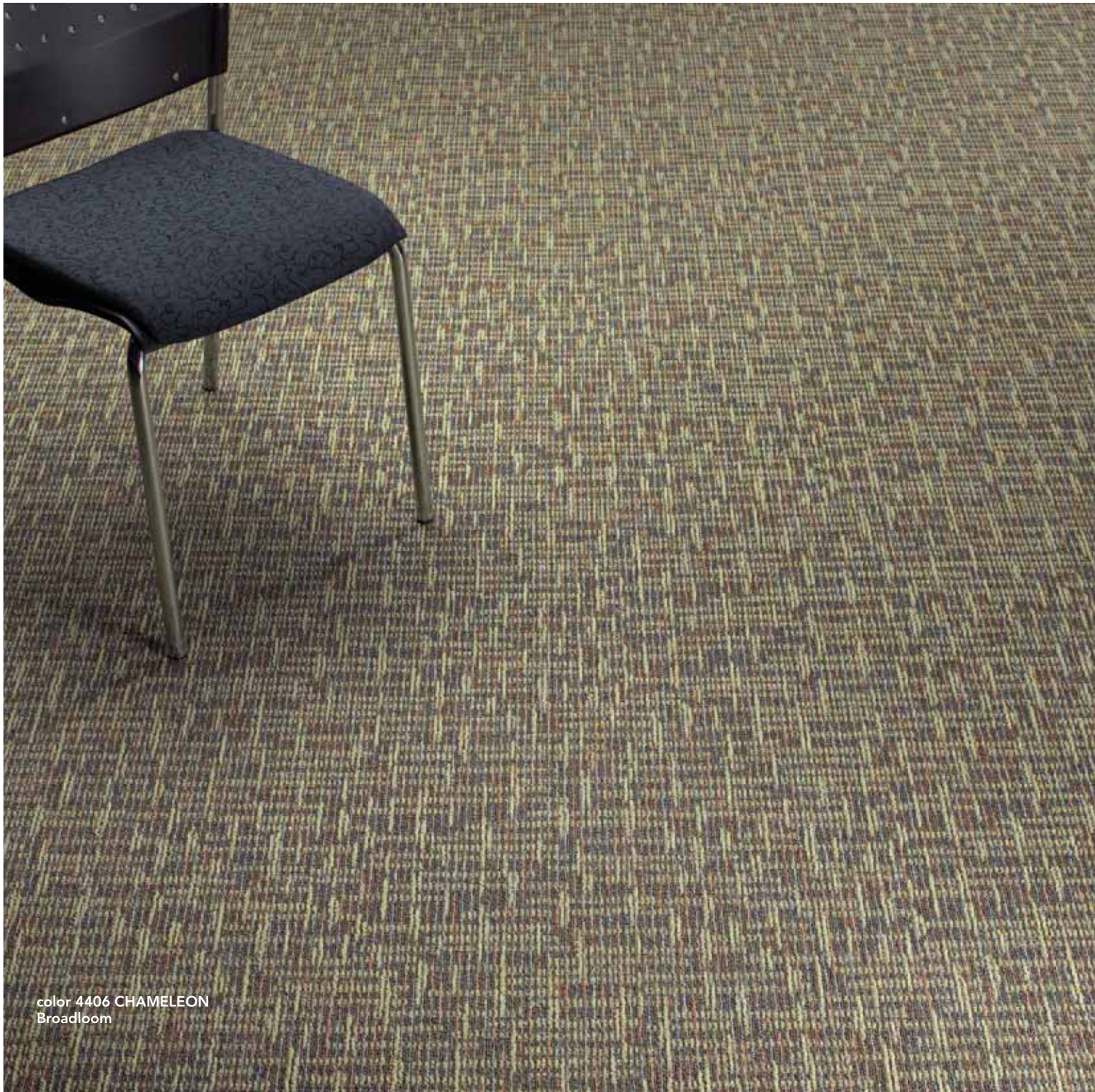
color 4406 CHAMELEON Broadloom