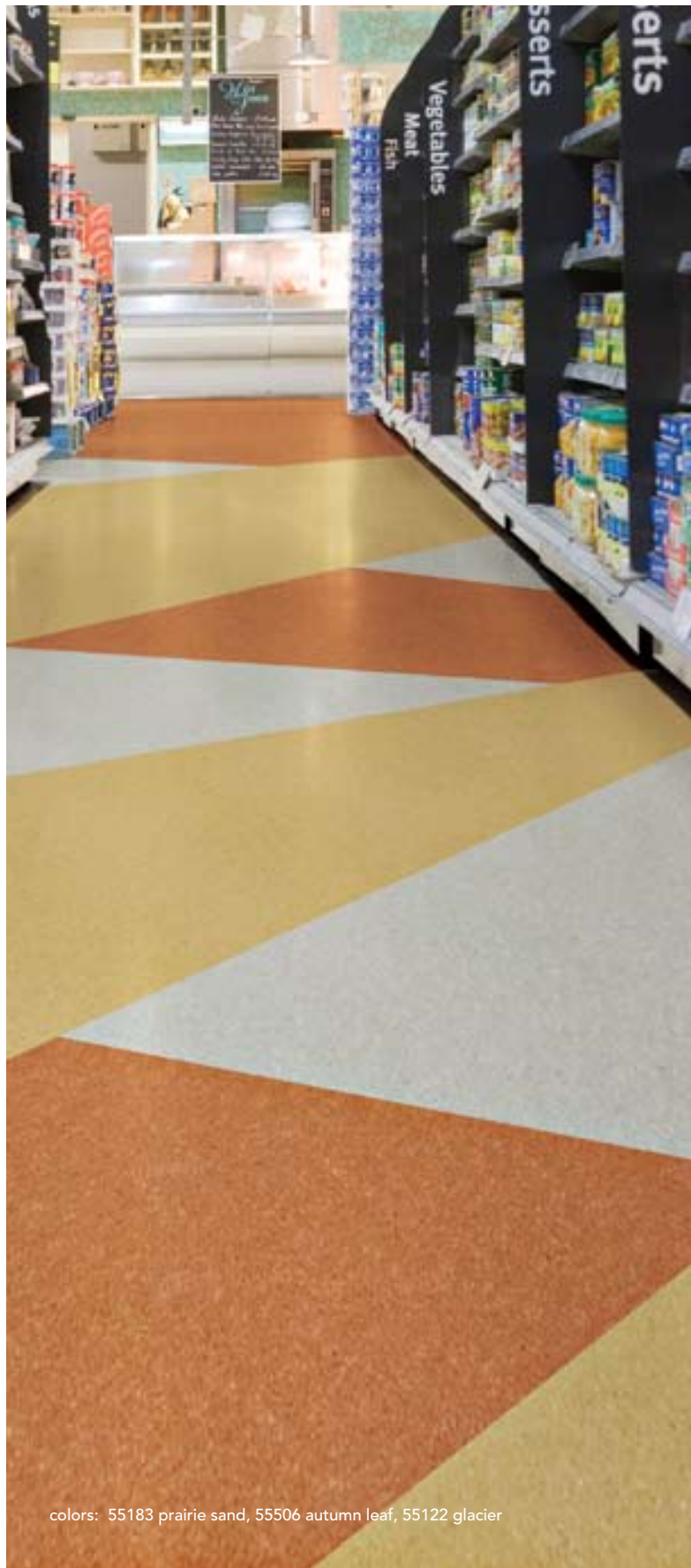
colors: 55183 prairie sand, 55506 autumn leaf, 55122 glacier